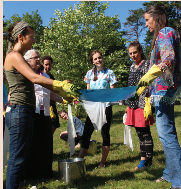
The power and alchemy of indigo dyeing.