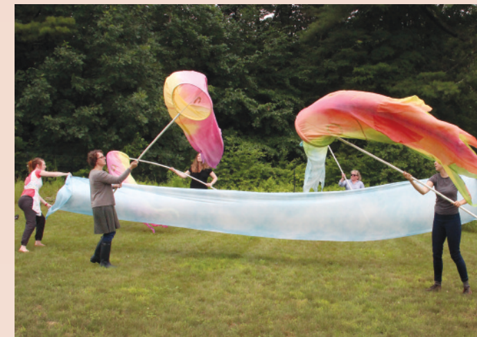
Handcrafted silk fish puppets.