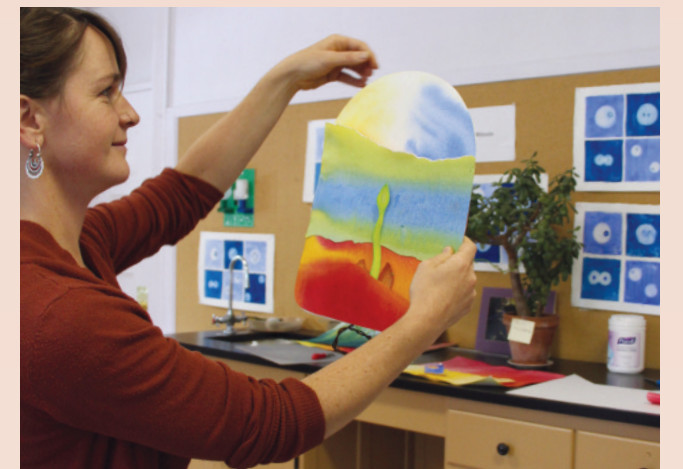
Moving pictures, crafted by the teacher, meet the imagination of the growing child.